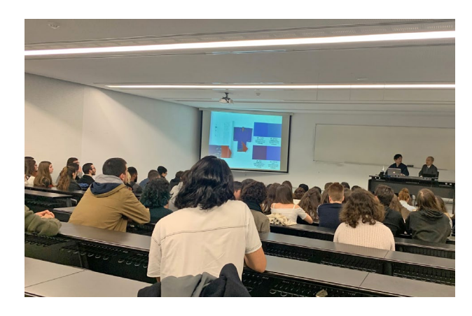
Fig.2 Photograph of one of workshop on international collaborative research