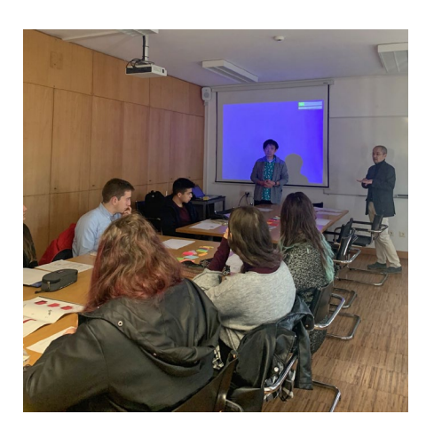
Fig.3 Photograph of one of lecture on international collaborative research