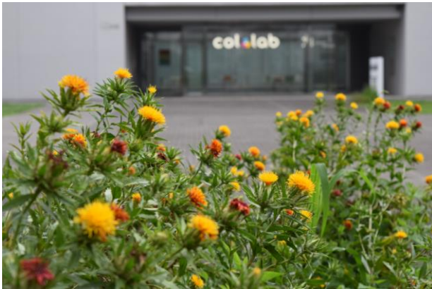
Fig. 2 Safflower grown on Atsugi campus.

Scientific considerations on the phenomenon that red pigment "Beni" produced from safflower has a green metallic luster when it is dried state.