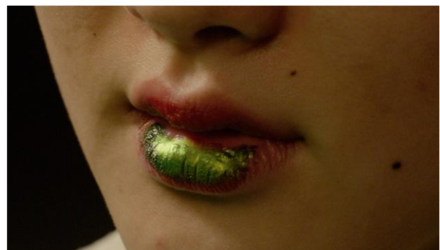
Fig. 5 Screen shot of green metallic luster of "Beni".