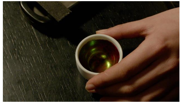
Fig. 3 Screen shot of "Beni".